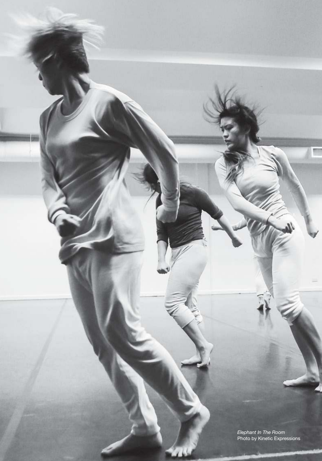
Elephant In The Room