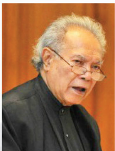
Emeritus Professor Edwin Thumboo