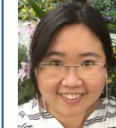
Too Chien Tei