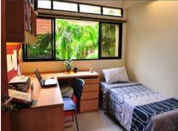
Single Room - Halls & Residences