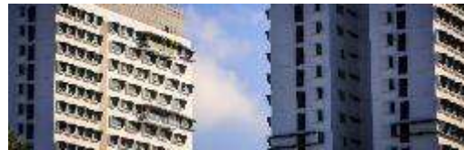
Cinnamon College Tembusu College

Living-learning communities, where students live and learn under one roof with their peers and professors.