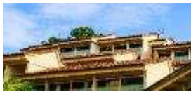
King Edward VII Hall