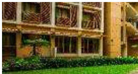
Kent Ridge Hall