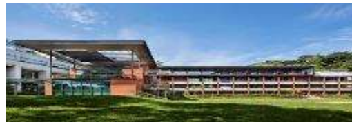
Ridge View Residential College