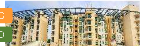
Prince George's Park Residences

A melting pot of nationalities and cultures.