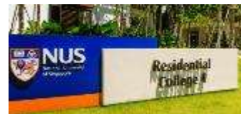
Residential College 4