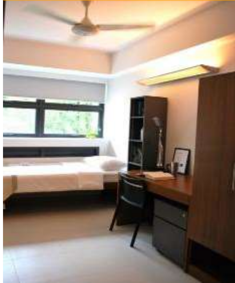
4 Bedroom Apartment