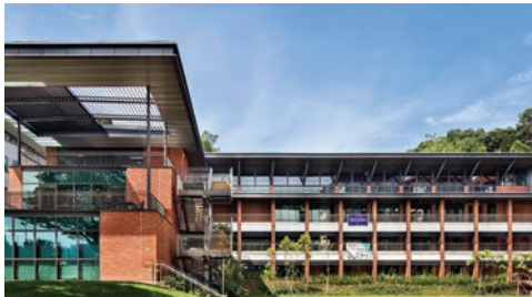
(Ridge View Residential College)

The Ridge View Residential College (RVRC) programme is a two-year residential experience with an integrated inter-disciplinary approach in sustainability, workplace readiness and communication. Its holistic design prepares students for life in university, and at the workplace in the future.