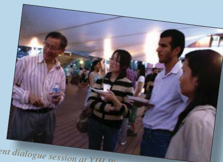
TLC student dialogue session at YIH Plaza on 5 May 2010.