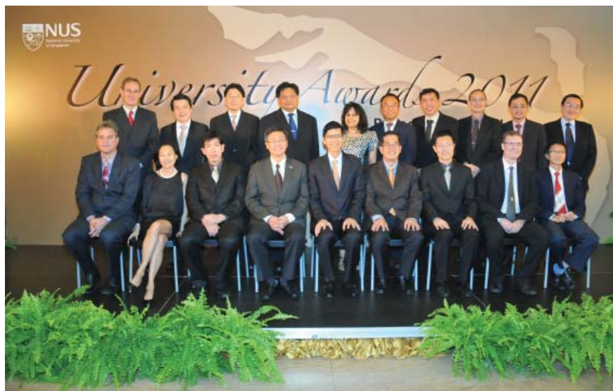
University Awards 2011 – Induction of new NUS Teaching Academy Fellows.