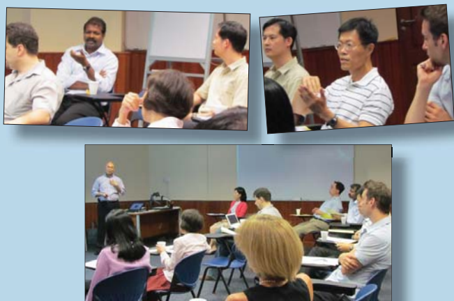
Peer Review sub-committee members lending their support at the workshop titled 'Are You Ready to be Peer Reviewed?': Preparing for the "Classroom Observation" component' conducted by CDTL on 7 April 2011.

Several projects undertaken by the NUS TA include: