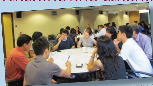
TLC student dialogue session at Alumni House on 17 Feb 2011.